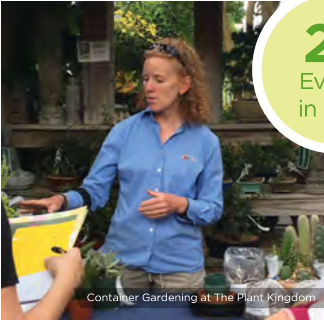
Container Gardening at The Plant Kingdom