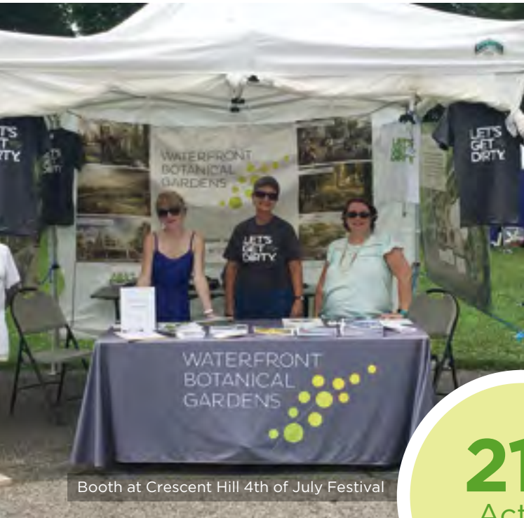
Booth at Crescent Hill 4th of July Festival