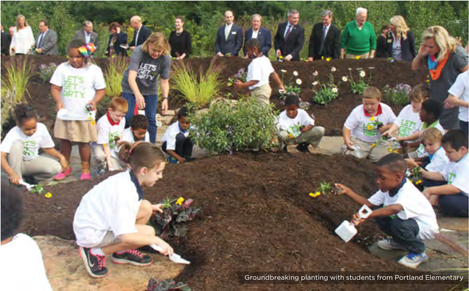
Groundbreaking planting with students from Portland Elementary