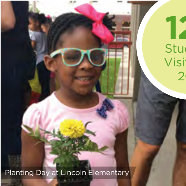
Planting Day at Lincoln Elementary

There is a lot of work to do and students from across Louisville have already made an impact. A group from Male High School is studying invasive species on the site. Children from Portland Elementary participated in the Groundbreaking planting ceremony. And, students from Lincoln Elementary planted their own gardens in front of their school with help from the Waterfront Botanical Gardens Education Committee.