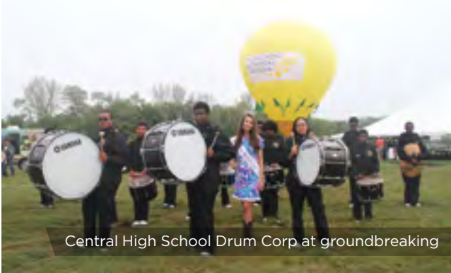
Central High School Drum Corp at groundbreaking