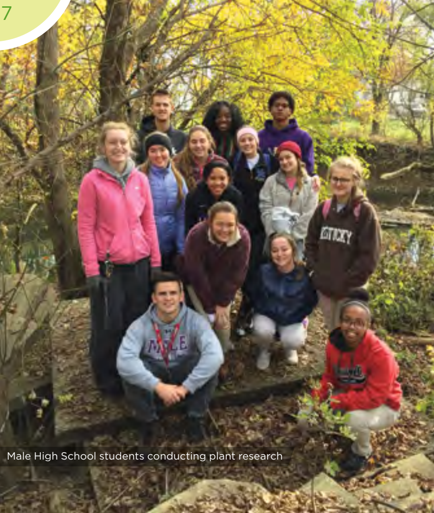
Male High School students conducting plant research