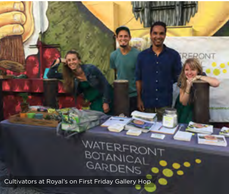
Cultivators at Royal's on First Friday Gallery Hop

The Cultivators sponsor several events throughout the year, including Sips & Seeds and the Homebrew Fair, to engage young professionals in their shared mission to support the gardens, and develop our future supporters, volunteers, board members, and staff.