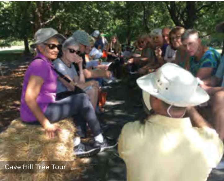
Cave Hill Tree Tour