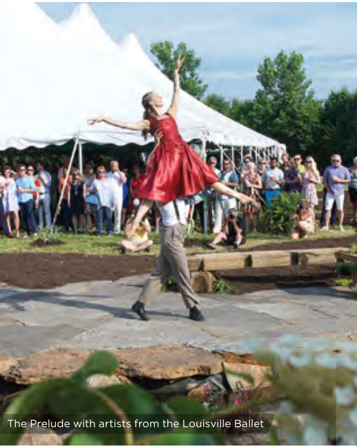
The Prelude with artists from the Louisville Ballet