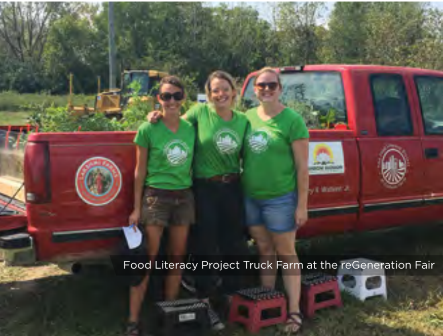
Food Literacy Project Truck Farm at the reGeneration Fair