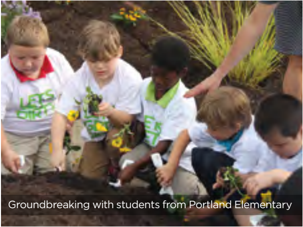
Groundbreaking with students from Portland Elementary