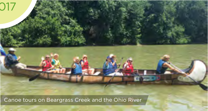
Canoe tours on Beargrass Creek and the Ohio River