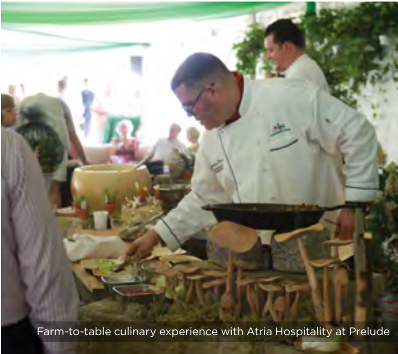
Farm-to-table culinary experience with Atria Hospitality at Prelude

We welcomed 750 people to our various programs and events in 2017. Once the gardens are complete, guests will visit for a myriad of reasons: to see a performance; to enjoy a farm-to-table meal; to learn about small-space gardening; to hear a speaker on clean water, and more.