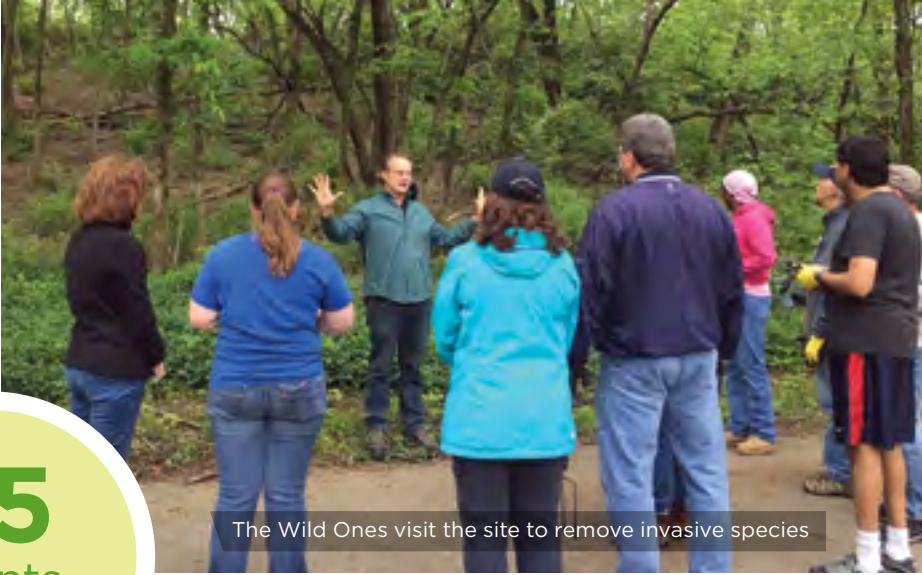
The Wild Ones visit the site to remove invasive species