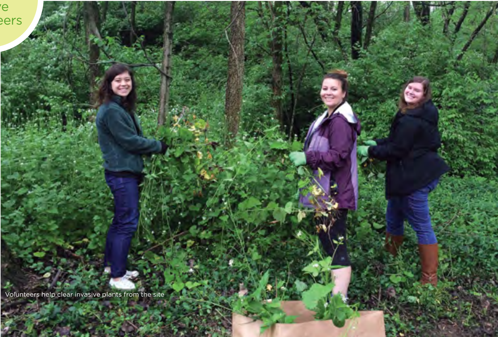
Volunteers help clear invasive plants from the site