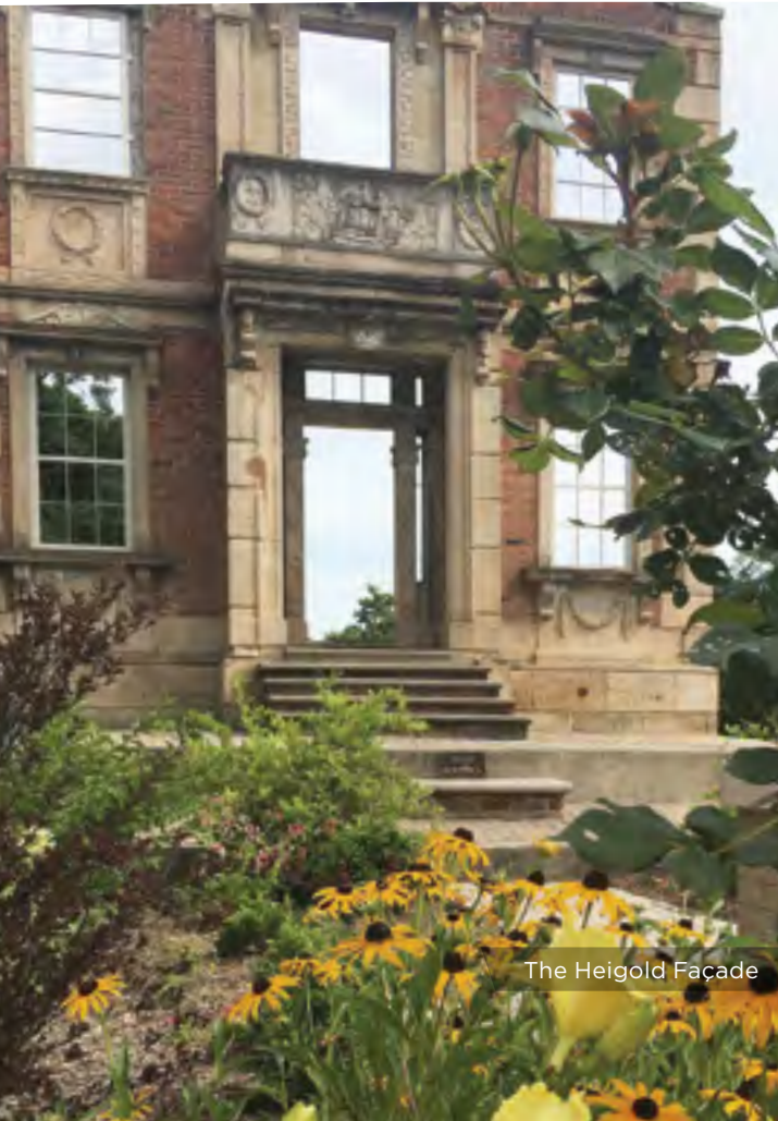
The Heigold Façade

In 1973, the dump closed. An eight-year closing plan was initiated that was designed to meet public health requirements and stringent EPA rules for filling and stabilizing the site.